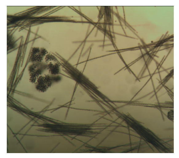
This 2017 algal bloom in the Charles River was dominated by rod-like Aphanizomenon , and also contained clustered Microcystis and crescent-shaped chain of Dolichospermum (formerly known as Anabaena ).

"YSI developed these integrated systems in response to the growing need for algal bloom research and monitoring," says Goucher, whose office, conveniently, is in Massachusetts. "The Charles River provided