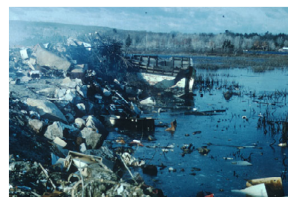
The Charles River became so polluted, that in 1875 government recommended abandoning cleanup efforts in areas.

Improvements in water quality in the Charles have been documented by the U.S. Environmental Protection Agency. EPA began issuing an annual "report card" grade for the lower reach of the river in 1995 based on water quality data collected by the association's volunteers.