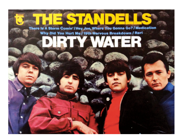
The Standells' 1966 hit 'Dirty Water—a mock paean about the then-famously polluted Charles River.