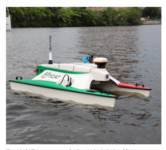
This HYCAT Autonomous Surface Vehicle helps CRWA researchers generate high resolution water quality, bathymetry, and flow data at once along the river.