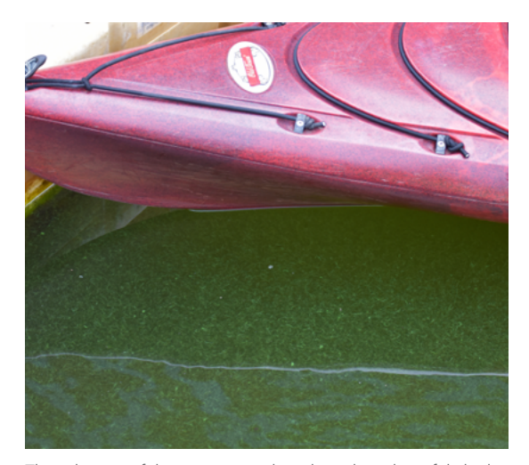
Though most of the conventional wisdom about harmful algal blooms tends to be based on studies of Microcystis , HABs in the Charles River tend to be dominated by Aphanizomenon .