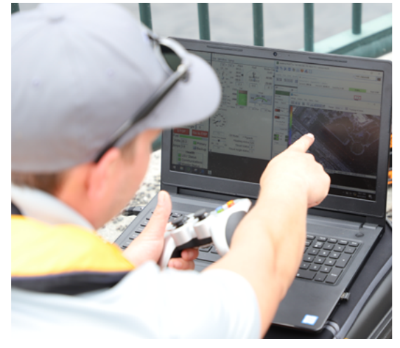
Innovative software allows the technician to plot a course for the autonomous systems using a georeferenced image of the study area.

That should give a new generation of Boston songwriters something to sing about.